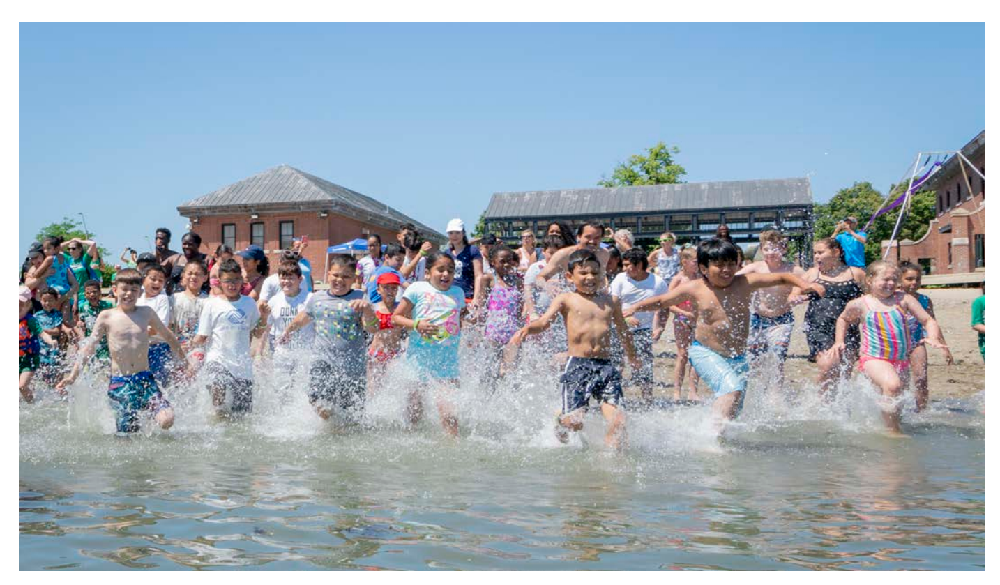
Working together, the Metropolitan Beaches Commission believes we can shape a future where our public beaches are shared and enjoyed by everyone.

The Commission recommends that Save the Harbor/ Save the Bay and the Commission jointly host workshops in Boston, Quincy and Lynn to help the Metropolitan Region's beachfront communities plan for sea-level rise and increasingly severe coastal storms.