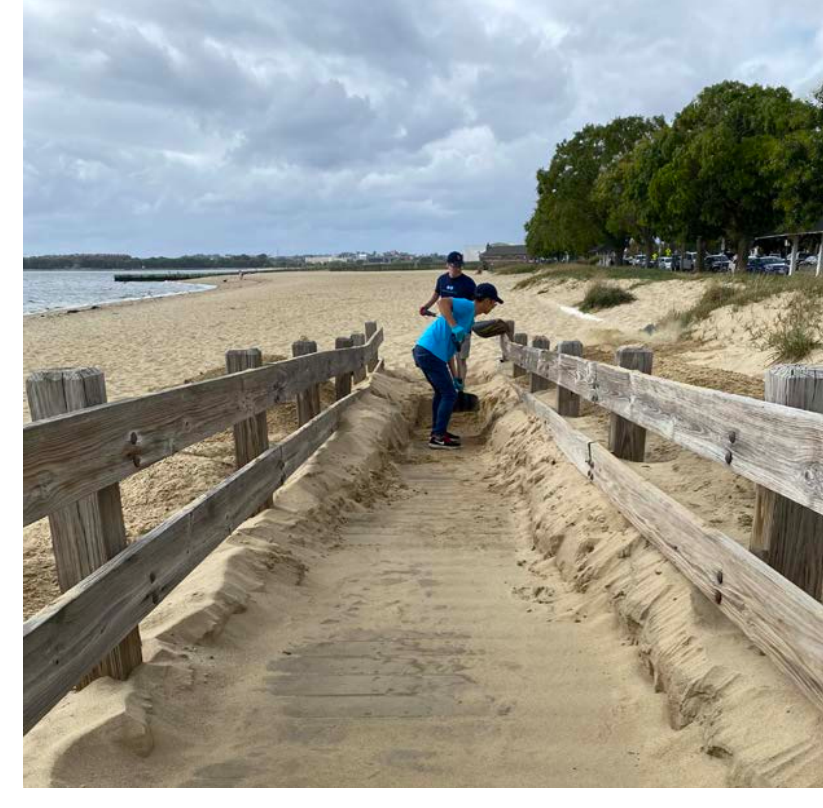
Clearing ramps regularly is an essential step to improve beach and water access for people with disabilities. Today, this practice is the exception, not the rule.