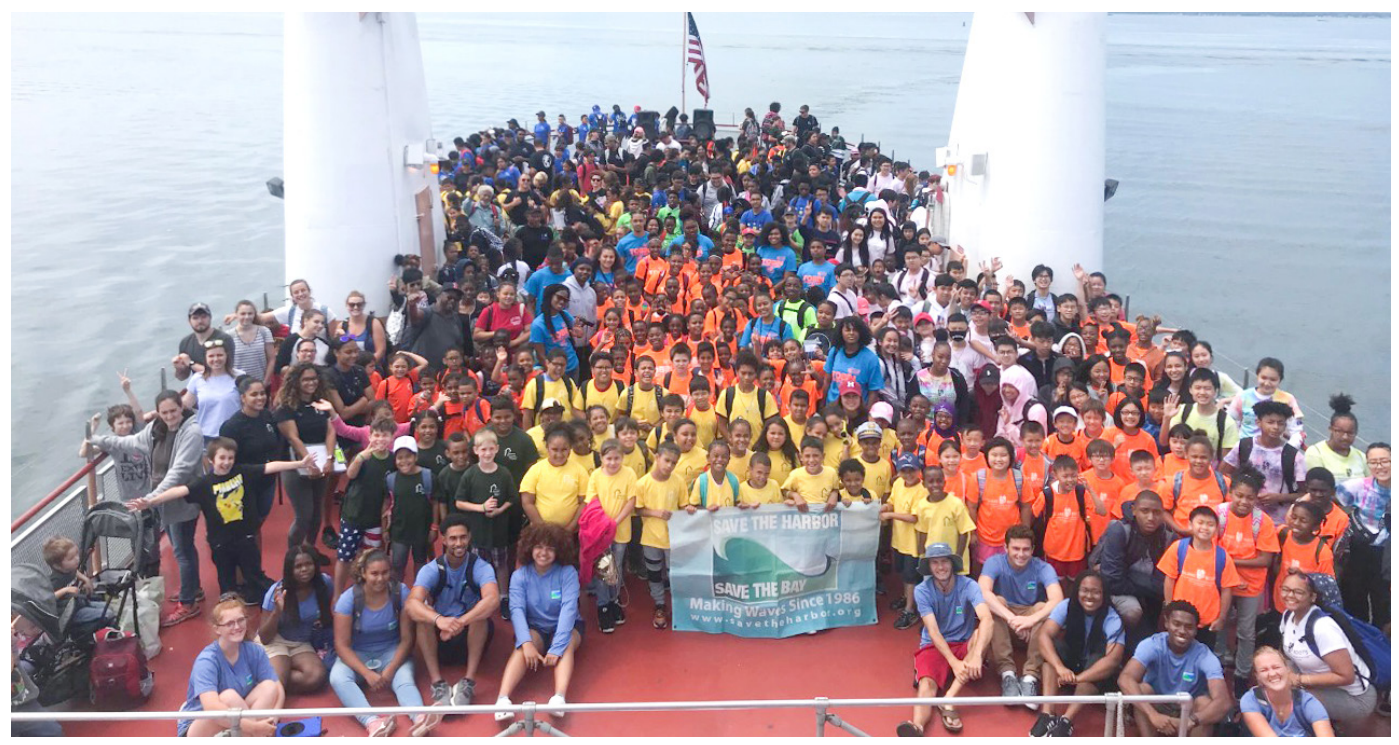
Tens of thousands of kids and families from over 100 Massachusetts communities rely on free access to "the People's Harbor" for health, relaxation and recreation every year.

Following our first public hearing, the Commission took immediate steps to increase diversity of representation within the Commission itself. The Commission also expanded its outreach efforts to people of color, people with