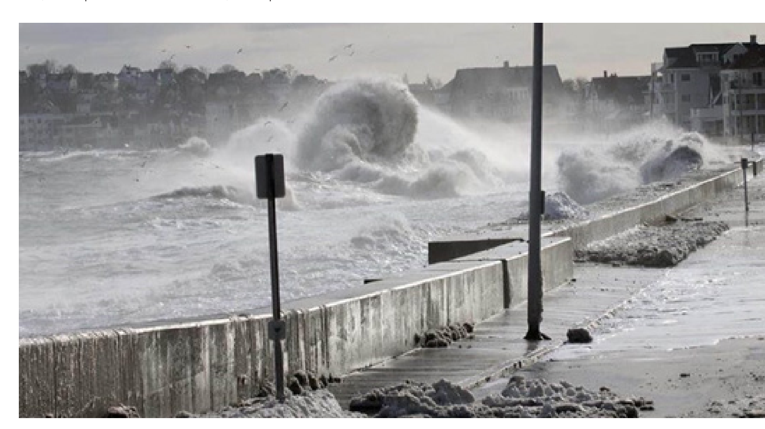
Sea level rise and more intense storms threaten both public safety and beach access in all our beachfront communities.

Sea level rise and climate impacts associated with global warming threaten both public safety and beach access in Lynn and Nahant, Revere, Winthrop, East Boston, South Boston, Dorchester, Quincy and Hull.