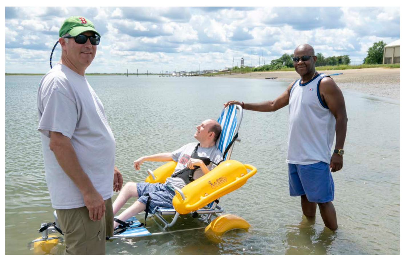
Providing mobility mats and wheelchairs at every beach is key to allowing people to become full participants rather than spectators on the region's public beaches.