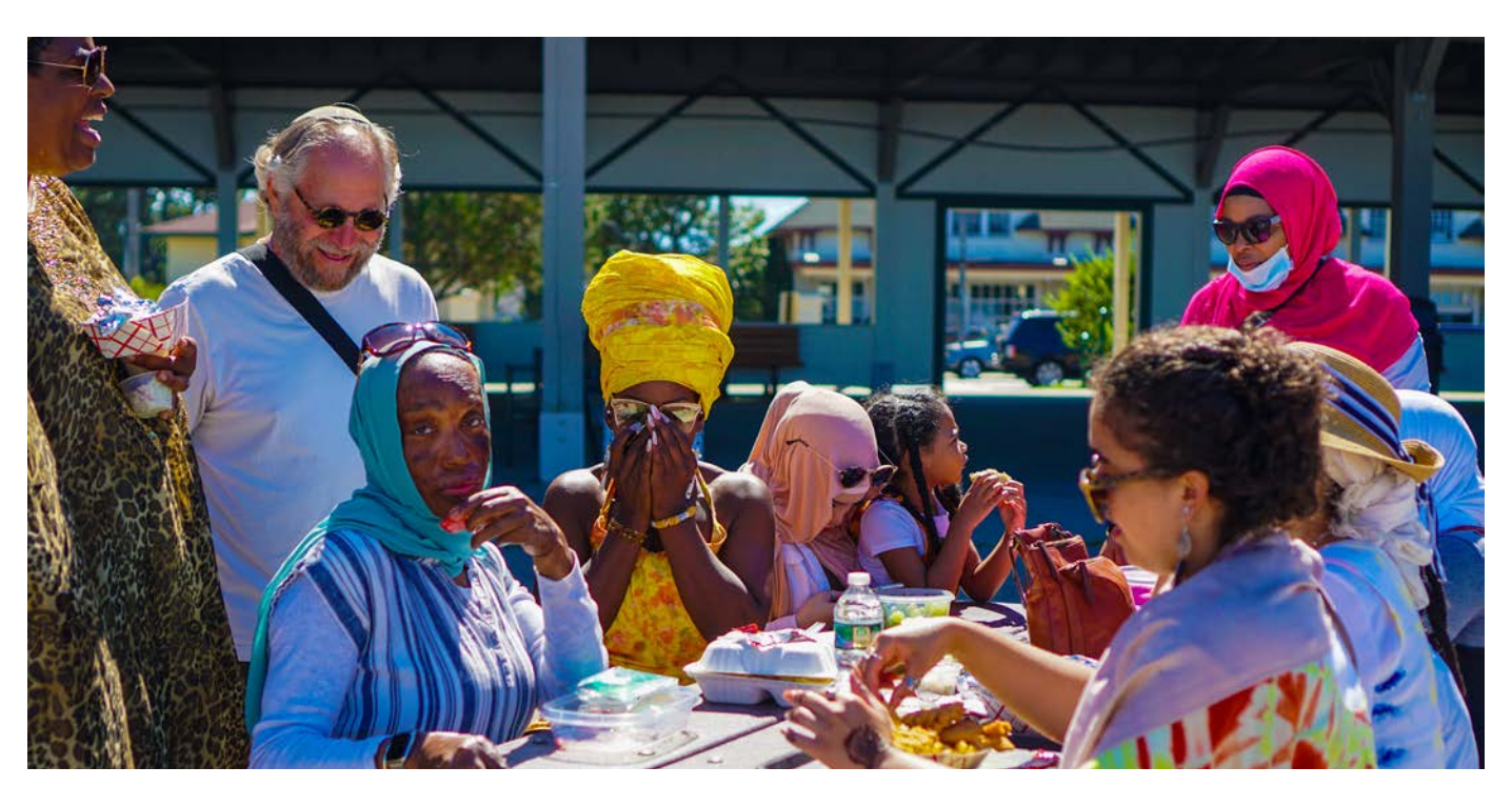
While improved conditions on the beaches increasingly draw residents from across the region, much work is needed before all residents will feel equally welcomed and embraced.

The following represents a high-level overview of the Commission's Findings and Recommendations, which are supplemented in the sections that follow by an overview of the Commission's inquiry process and specific findings drawn from each of its public hearings.