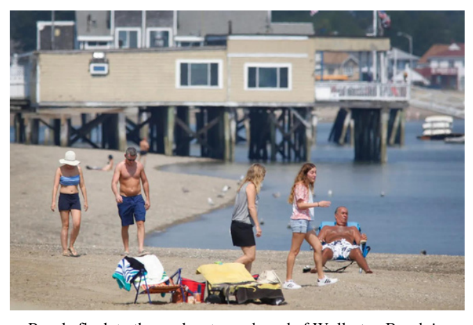
People flock to the cool water and sand of Wollaston Beach in Quincy to beat the heat on Monday, July 26, 2021.

Save the Harbor/Save the Bay is a nonprofit group that advises the state's beaches commission.